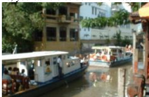
Melaka River Boat Ride

At the same time, you can cruise down the historical Melaka River.