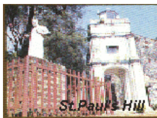
St. Paul's Hill

A short historical tour of Melaka historical sites with an English Tour Guide is also included