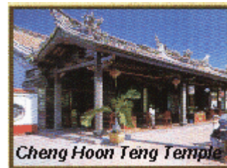
Cheng Hoon Teng Temple

At the same time, you can cruise down the historical Melaka River.