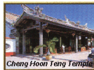
Cheng Hoon Teng Temple

At the same time, you can cruise down the historical Melaka River.