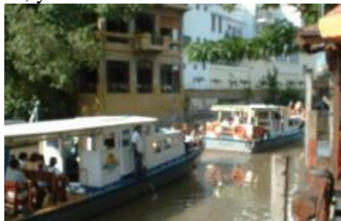
Melaka River Boat Ride

At the same time, you can cruise down the historical Melaka River.