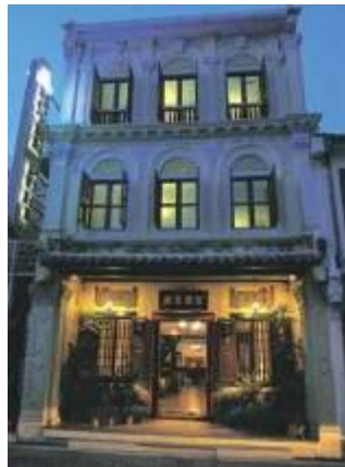
Hotel Puri, Melaka

Come and enjoy this specially packaged tour to historical Melaka for two during weekdays. In this package, you and your companion will stay in a Standard Room of a 200 years old Heritage Building in the heart of Old Melaka Chinatown.