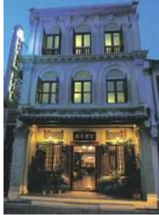
Hotel Puri, Melaka

Come and enjoy this specially packaged tour to historical Melaka for two during weekdays. In this package, you and your companion will stay in a Standard Room of a 200 years old Heritage Building in the heart of Old Melaka Chinatown.