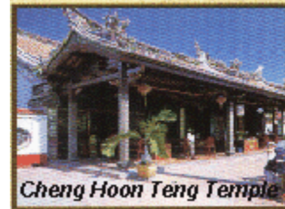
Cheng Hoon Teng Temple

Also visit Night market at Jln Kee Ann or take a boatride on Melaka River