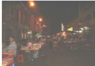
Jalan Kee Ann Night Market