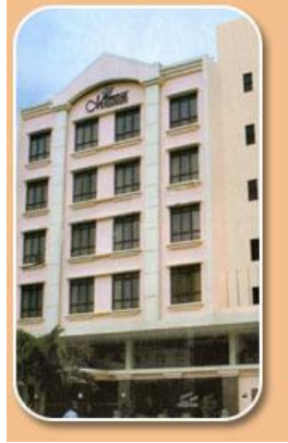
Mimosa Hotel, Melaka

Come and enjoy this specially packaged tour to historical Melaka Chinatown for two. In this package, you and your companion will stay in a 5 Storeys Hotel in the heart of Melaka New Chinatown. Parking is available to hotel guests.