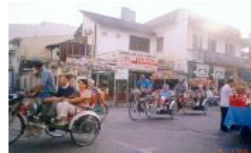
Take a Beca Ride

From Mondays to Sundays, you can walk around Jalan Kee Ann Night market where you can savour local cuisines, buy fruits or take a beca ride. On Fridays to Sundays, you can walk to the famous Jonker's Walk at your leisure to buy local handicrafts, antiques and dine besides the Melaka River if you want.