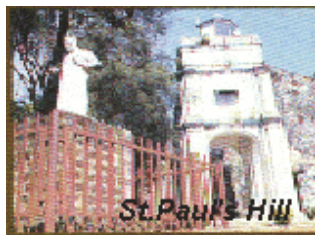
St. Paul's Hill

A short historical tour of Melaka historical sites with an English Tour Guide is also included.